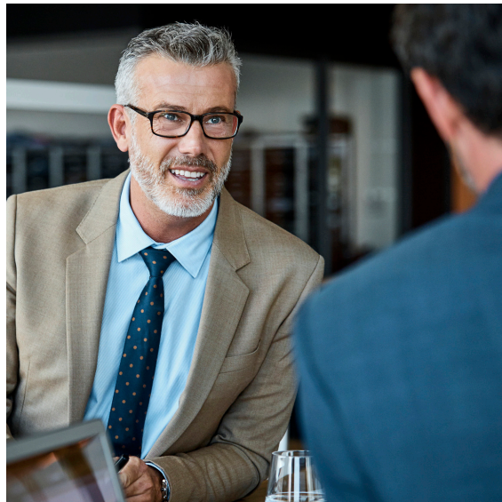
Registered Investment Advisors

As Registered Investment Advisors and Individual Advisory Representatives, your clients rely on you to help them achieve their dreams. But don't forget about your own. Doesn't it make sense to work with a partner who specializes in lending to your industry, one who provides a relationship-based approach and has the capital you need to support your practice today, and your successes tomorrow?