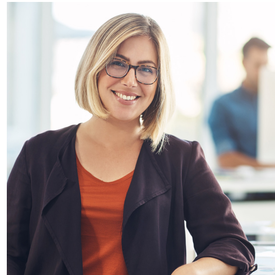
Individual Advisory Representatives